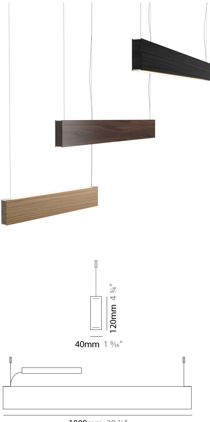
1000mm 39 3/8"